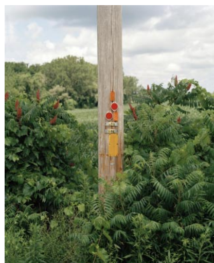
06_ Outgrown, Weedsport, NY, 2020