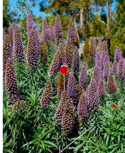
08_Pride of Madeira, Shoreline Highway, CA, 2019