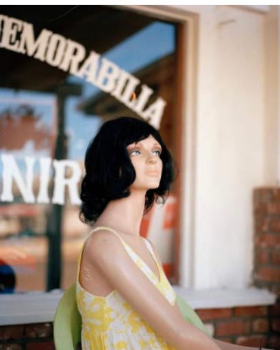
05_ Memorabilia, Seligman, AZ, 2023