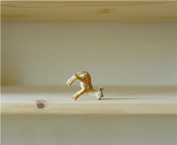
01_ Deer, Queens, NY, 2017