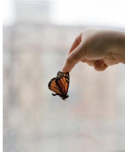
02_ Hold On, Queens, NY, 2020