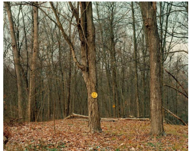
10_Graveside Smile, Manns Choice, PA, 2021