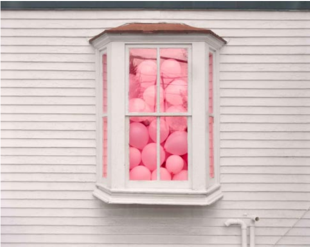
07_Pink Balloons, Doylestown, PA, 2021