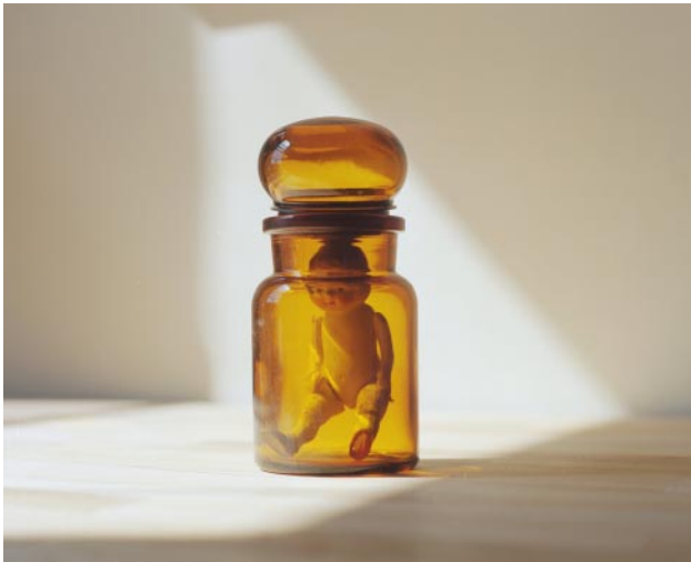
03_ In a Jar, Queens, NY, 2020