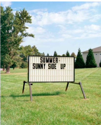
11_Sunny Side Up, Boonsboro, MD, 2022