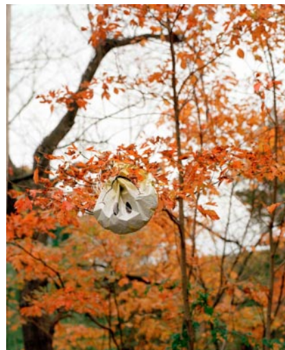
12_Upside Down Smile, Ringtown, PA, 2021