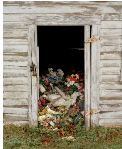
04_ Long Reach Cemetery, New Matamoras, OH, 2021