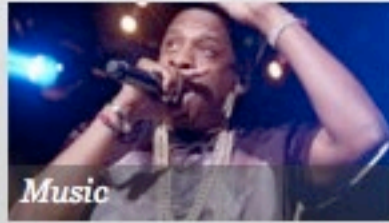
Music Jay-Z, Run-DMC, and More: The Made in America Fest in Photos