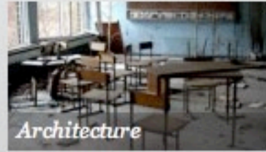
Architecture Fascinating Photos of 11 Abandoned Schools