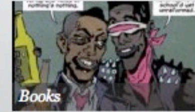
Books Exclusive Peek: See 'Romeo and Juliet' Re-imagined in '80s Brooklyn