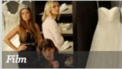
Film Flavorwire's Guide to Indie Flicks to See in September