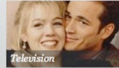
Television 10 Fictional TV Duos We'd Like to See Team Up Again