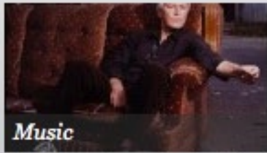
Music The Most Insanely Prolific Artists in Music