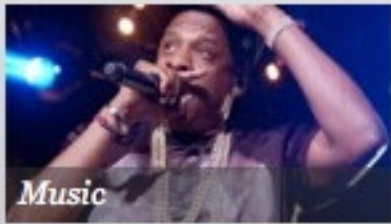
Music Jay-Z, Run-DMC, and More: The Made in America Fest in Photos