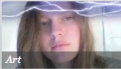
Art 11 Net Artists You Should Know